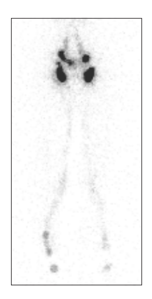
Figure 1. A normal pattern of lymphoscintigraphy of the lower limbs.